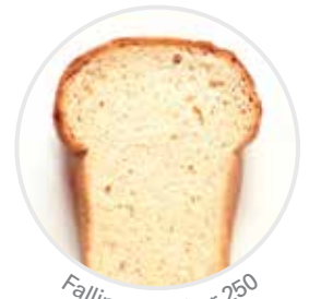
Falling Number 250